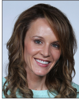
Jackie Stiles Assistant Coach Fourth Year